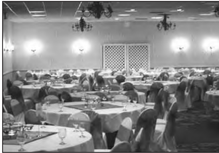
■ A banquet room at the Orlando International Hotel and Conference Center

Room rates for the event range from $72 to $89 per night. To register, please call the hotel at 407-859-0380, as their website will not take reservations. Please be sure to ask for the "LP Group Rate" to ensure your low price. Group room rates will be honored from three days before to three days after the event.