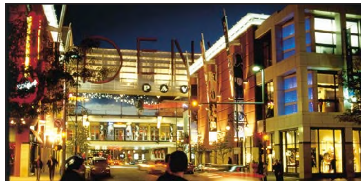
■ Denver Pavillions on the 16th Street Mall has 50 shops and restaurants under a dramatic block-long "Denver" sign.

Within three miles of the Adam's Mark Hotel there is Coor's Field, which has tours provided there is no baseball